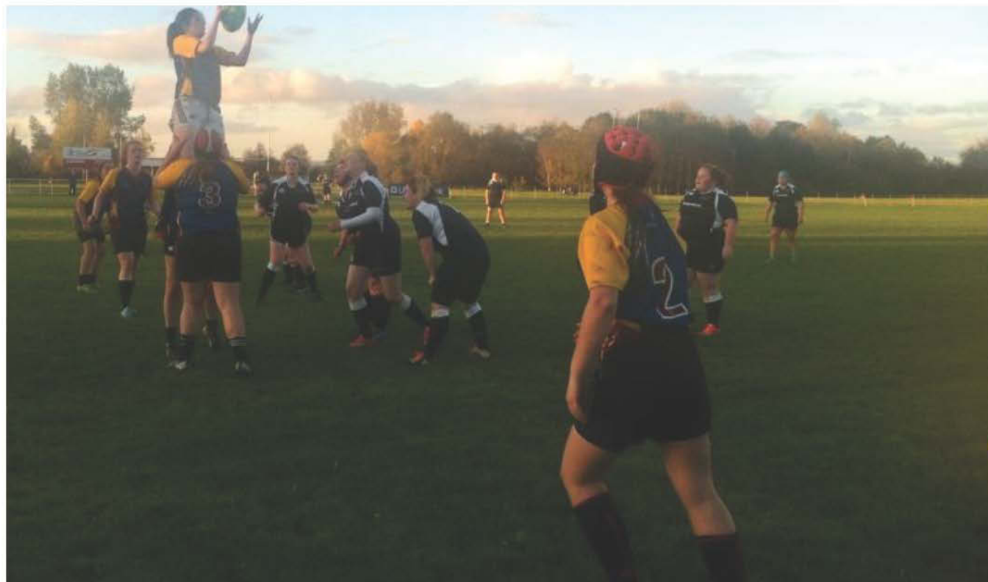
ULLR Division 2 team in action against IT Tallaght in October, winning 34-10.

We kicked off last semester with not only two new coaches, but two teams. Both our Division 1 and Division 2 team kick their league title races off